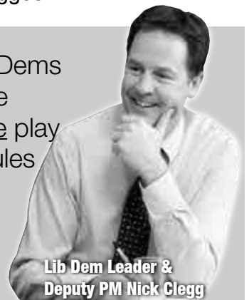
Lib Dem Leader & Deputy PM Nick Clegg

The Lib Dems will make everyone play by the rules on tax